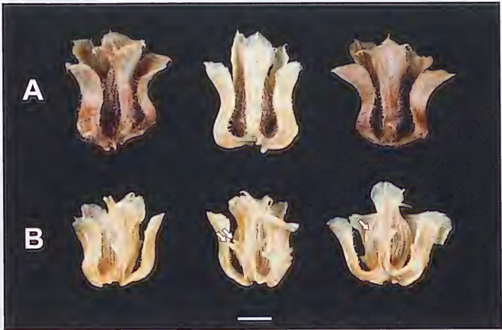
Figure 2. A – tepals at the fruiting stage of Amaranthus centralis (G. Chippendale 482), scale = 1 mm; B – tepals at the fruiting stage of A. induratus (K.M. Allan 587), arrows indicating single or serrated tooth-like projections on tepal margins, scale = 1 mm.